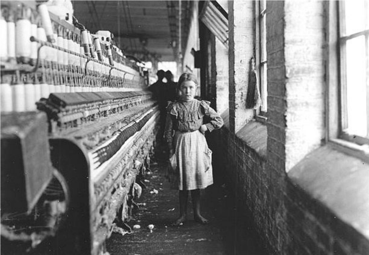
Cotton Mill A young 8 year old. Location: Georgia