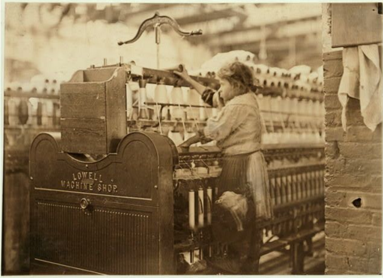
1.19.1909. Bibb Mill No. 1. Jan. 19, 1909. Location: Macon, Georgia.